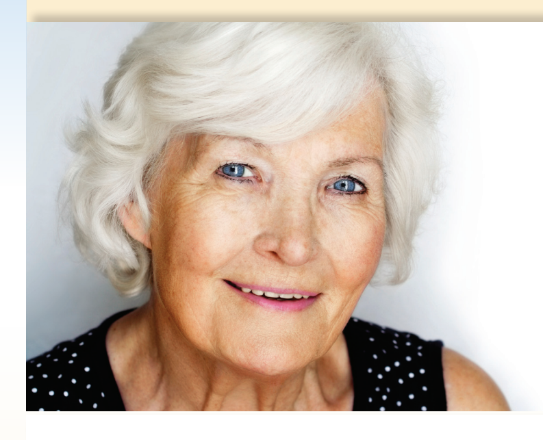
Summa Seniors Institute Center for Senior Health

Center for Senior Health Summa Wadsworth-Rittman Hospital 195 Wadsworth Rd. Wadsworth, OH